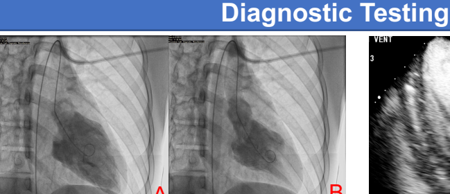
Figure 1A: Angiogram Figure 1B: Angiogram Angiographic view of the left Angiographic view of the left ventricle. The apex and the ventricle in systole. The basal base of the heart are in full segment remains expanded expansion as the end diastolic while the apex of the heart volume is reached. contracts, indicating reverse variant.

AVMs occur when a group of blood vessels form incorrectly in the body. The arteries and veins are intertwined in such a way allowing them to bypass normal tissue. Many AVMs develop before or shortly after birth. Typically, there are no associated symptoms or presentations of AVM's. Their discovery occurs through imaging for separate concerns or when they rupture. Sometimes, AVMs can decrease the amount of oxygen that is delivered to the brain and spinal cord. Capillaries do not exist within the malformed vessel network. Thus, the velocity of blood is never decreased to deliver oxygen and nutrients to parts of the body 4.